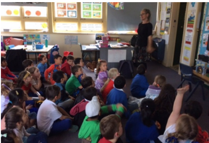
The Book Parade was a great success with children coming as their favourite book characters.